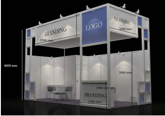
Design – 3: EUR 85/m 2