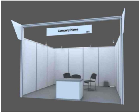
Design – 1: EUR 40/m 2