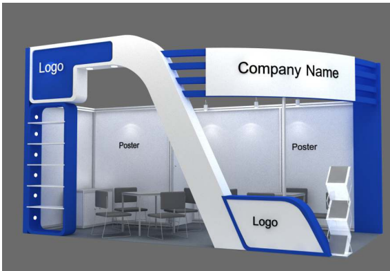
Design – 4: EUR 144/m 2

Printing of company logo and branding is included in the package. Printing of graphics for wall panels is not included but can be ordered at an additional charge.